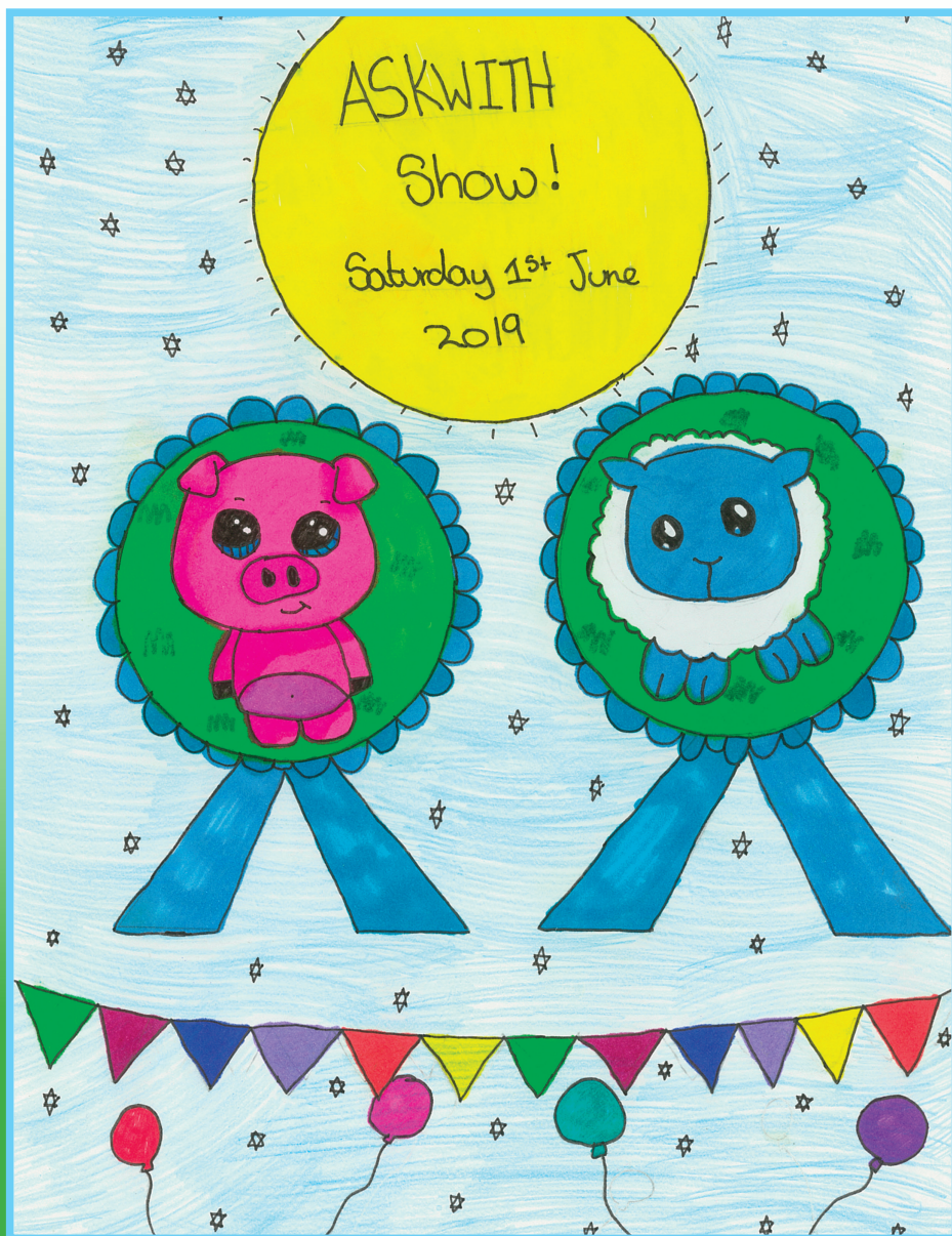
Eva Gray (age 12)