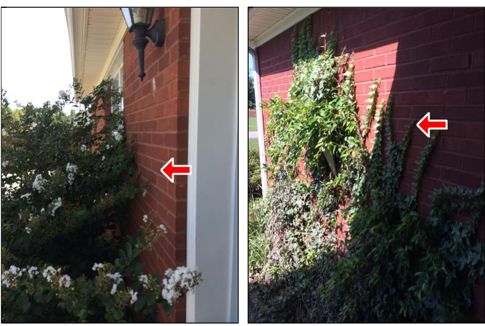
2.4 Item 1(Picture)2.4 Item 2(Picture)Picture #1,2 All landscaping should be pruned away from the house.

2.4 Vegetation, Grading, Drainage, Driveways, Patio Floor, Walkways and Retaining Walls (With respect to their effect on the condition of the building) Repair or Replace