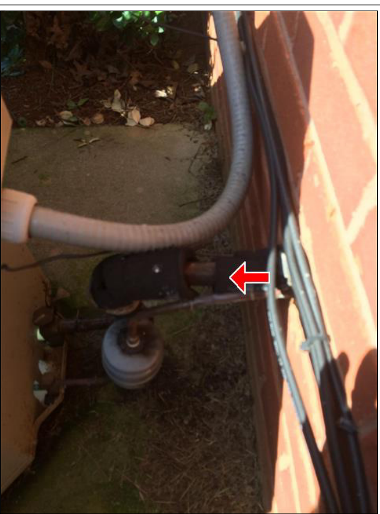
8.3 Item 3(Picture)