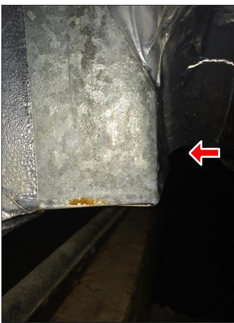
8.3 Item 2(Picture)