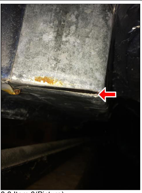
8.3 Item 6(Picture)

Picture #1,2 Air leak where air handler connects to ductwork which is causing heavy condensation in this area. Recommend repairs by a licensed HVAC contractor.