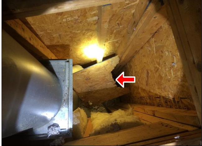
1.2 Item 3(Picture)