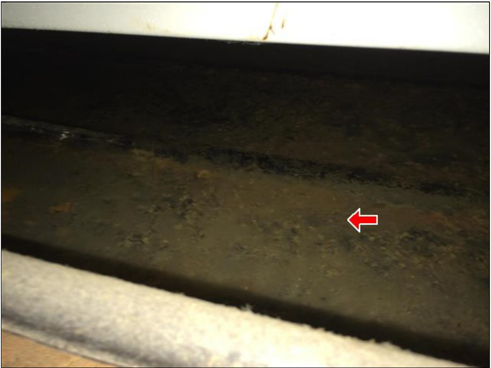
8.3 Item 4(Picture)