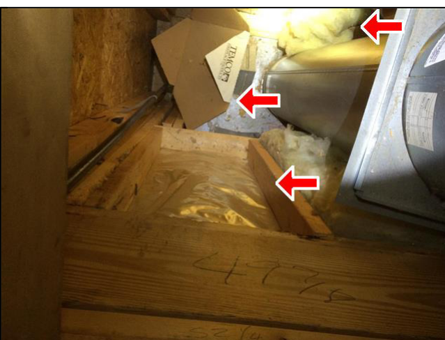
1.2 Item 4(Picture)