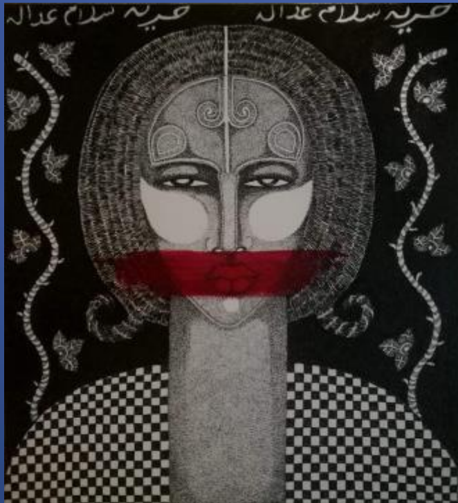
Illustration by Amel Bashir