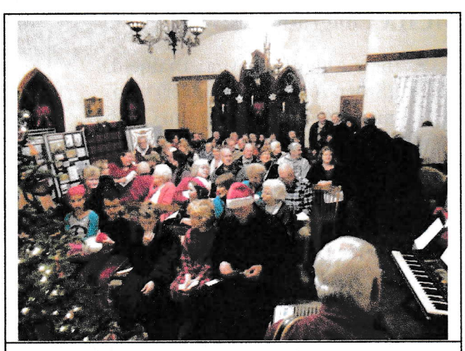
Front row performers await their time