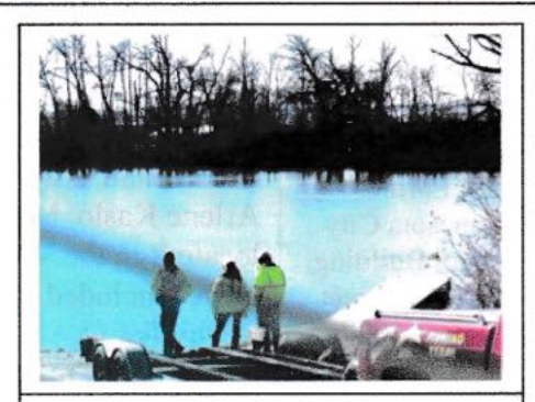
Observing the derailment from Highway 35.

Local media have given coverage to the BNSF (Burlington Northern Sante Fe) train derailment at Alma on Saturday, Nov 7. Persons familiar with the area will have recognized that there is some distance between the tracks and the village of Alma which was voluntarily evacuated until information about the spill was secured. The spill, identified as ethanol, did not ignite, a significant danger of such events. Some twenty railway cars derailed. This was the first of two Wisconsin derailments of the weekend, the second occurring at Watertown on Sunday afternoon. Environmentalist concern about railway oversight has been heightened as well as residents' awareness of potential