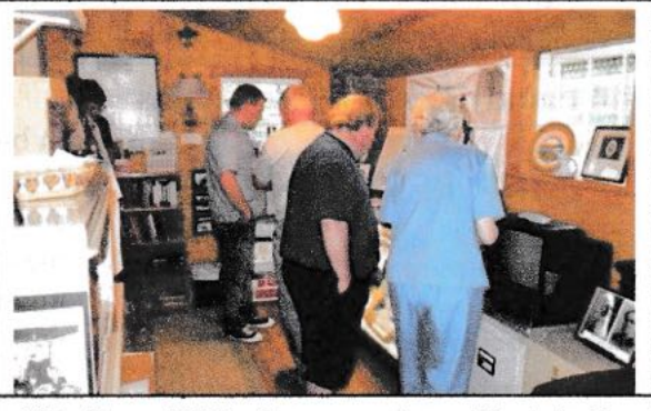
City Council Members examine artifacts in the MCHA archives on June 2.

On June 2, following their regular council meeting, the members crossed the street to visit the MCHA archives, and following a brief powerpoint presentation on the history of the placement of the archives in the First Baptist Church, visited the rooms housing the archives. The abundance of materials now available related to Minnesota City and