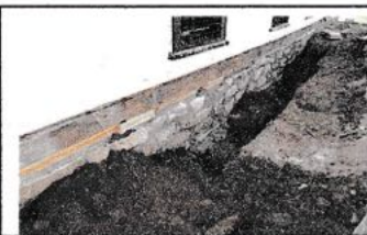
Foundation restoration near completion. Original stones reused with cement mortar after replacement of most of the floor joists.

The long search of the First Baptist Ladies Aid for construction personnel to realign the right wall of the historic Baptist Church has come to an end with the project completion by the R. J. Jaworski Construction Company of Whitehall, Wisconsin. The Historic church, the first in Winona County, constructed in 1875, now appears ready to withstand the challenges of age and environment well into the century. First Baptist Ladies have now replaced the photos, the eight day clock, and again welcome