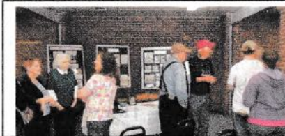
Visiting about First Baptist Church at Former Minnesota City School, relocation site of Minnesota City Day open house.

visitors to view the unique baptismal tank and the indoor outhouse. Watch for announcements of future events related to the church. Minnesota Citizens and all area humanitarians welcome the restoration of this building which continues to put Minnesota City on maps and retains memories of former members and residents.