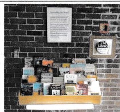
Book Give Away Library at 115 Iowa Street