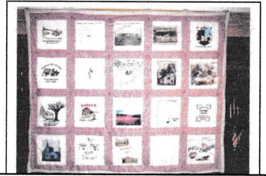
Minnesota City Heritage Quilt Constructed in 2002 by St. Paul's Church Quilters.

Persons interested in being represented on the second quilt will find the squares available in the Church Hall