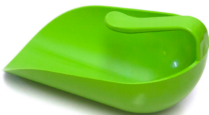
Feed Scoop 2000 Inverted handle