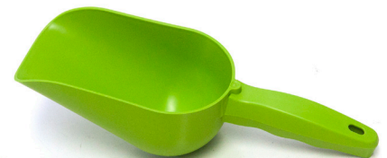
Feed Scoop 500