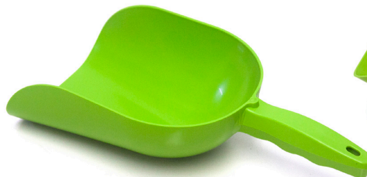
Feed Scoop 2000