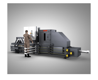
Loading aperture of 1000 mm suitable for larger material pieces and higher throughput rates