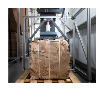
Available as an option with manual strapping