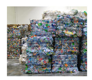
Compresses paper, cardboard, plastic film and PET bottles