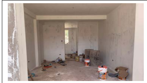
Above are some updated photos on the construction of the dorm rooms which will house the married students with families. They will soon be working on the ceramic tiles in the bathroom. Thank you for your prayers and finances with this building project.