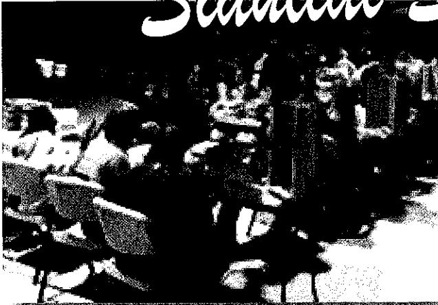
Southeast Bible Baptist (Rochester) did 25,000 Lithuanian John and Romans for their annual project this weekend.

In just two months our team will arrive in Siauliai to undertake the opportunity to distribute the Word of God to a religious but lost people. Please pray for much fruit!