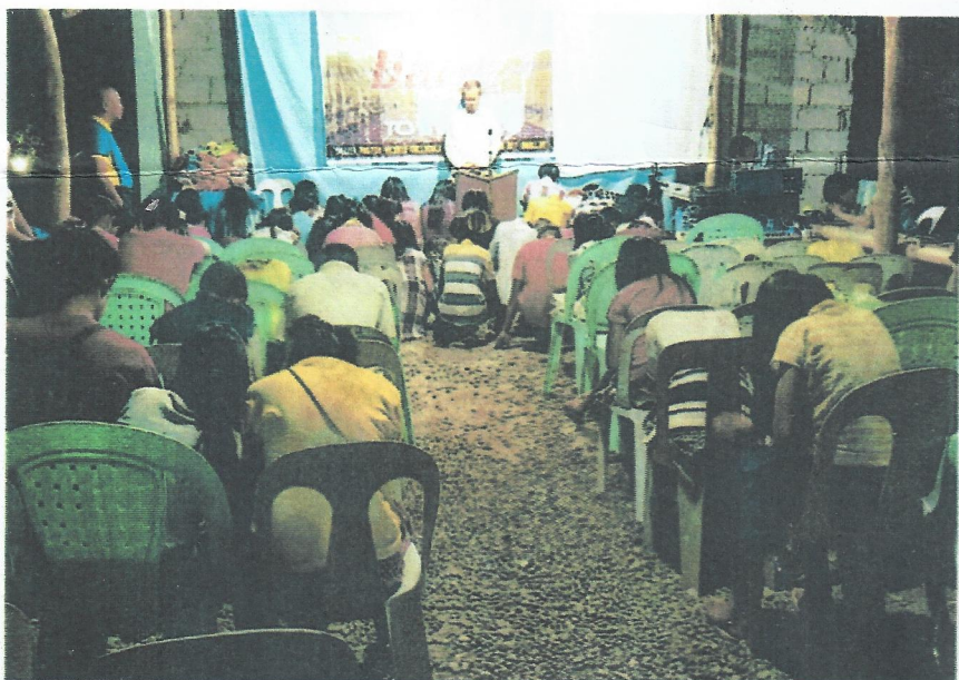
Antique campers making decisions on their knees