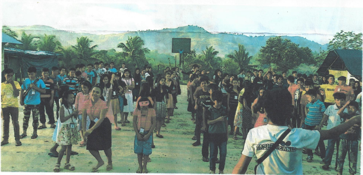
Morning line up at one of the youth camps in the mountains

"I'm thankful for my kids who did most of the program. They led the different groups in games, special music, and power point lessons. They took pictures and videos, and printed T-shirts with our theme, "Dare to