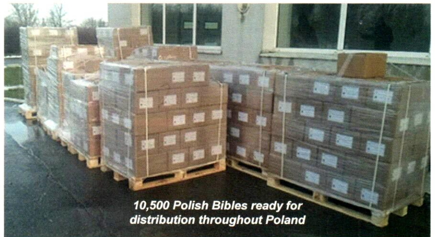
10,500 Polish Bibles ready for distribution throughout Poland

Thank you for praying for and supporting us so that we can continue to deliver the Word of God throughout Eastern Europe.