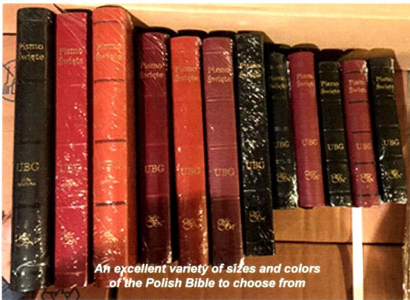
An excellent variety of sizes and colors of the Polish Bible to choose from