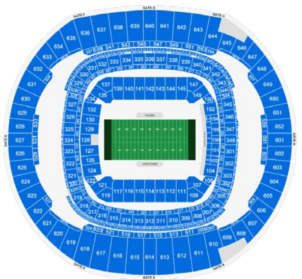
Click here for more info on seating at the 2025 Super Bowl online