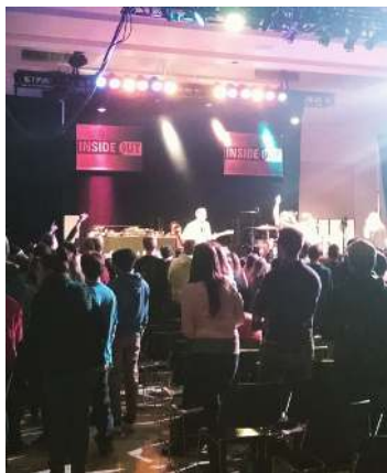
Snapshot of the Excel Conference

During the Christmas break I hosted two Christmas parties for teens at my home. I usually read the Christmas story because many have never heard it. This year I decided to add a twist. I had my son drag a manger up into the woods just above the house and then make a Cross from sticks which we then placed by the manger. Next, we hung a light up in a tree just above the manger and Cross. I took each group outside and asked them to think about the true meaning of Christmas as they walked in the dark up to the trail leading into the woods. When we arrived at the place where the manger and the Cross were I had my son, who remained back at the house, switch on the light. A short devotional was read that discussed the true meaning of Christmas: that one must see it in the shadow of the Cross. Please pray that this adventure into the woods will be a lesson about Christmas that they will not forget, and that they will come to know the meaning of Christmas in a personal way. This is our prayer for all teens.