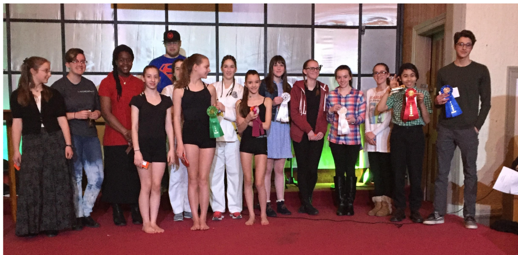
TALENT and ART SHOW-2018

YFC has a busy spring ahead of us, including the 5 th Annual Joker Run coming up on April 7 th . It is not too late to register. We take registrations right up to the day of the event for both runners and walkers. We are hopeful that the Joker Run will become one of our most successful fundraisers. Please pray for safety, good weather, lots of runners/walkers and business sponsors. We would love to have a large group of spectators to encourage runners and walkers, if you are able to get to Unadilla for race day.