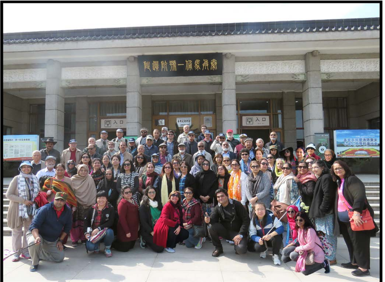
Fond Memories OF Lhasa /China Visit 10 Oct - 24 Oct - 2017