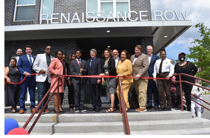
Grand Opening of Renaissance Row Apartments in Baltimore