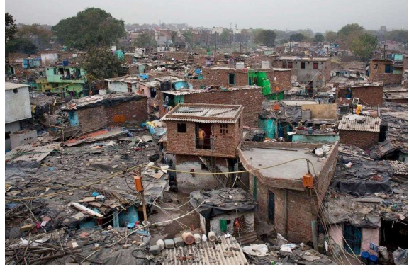
The world that we allow because of our ignorance about the existence of the globalist deep state

It is now time for the Real Greens to assert ourselves and to take back the true green narrative. It is also time for all of us, the ordinary people – people who just want to see the pursuit of truth, justice and compassion, not to mention the use of sane and human-scale economics and the common-sense nurturing of the world's ecosystems – to come together and so prevail over these globalist ambitions of this malicious and controlling Deep State. Such an impetus to mobilise the truth would also provide the ideal opportunity for genuine scientists to then feel unfettered and safe enough to explain and explore the deliberately suppressed but proven solutions and technologies that are now so desperately needed by all the peoples of the world.