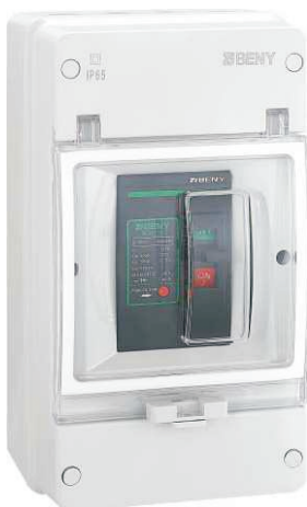
BDM-125 with IP65 Enclosure