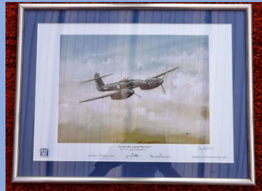
Whirlwind Prototype by Dave Gibbings MBE