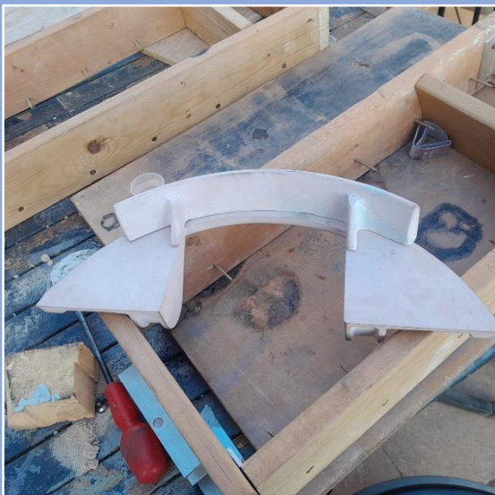
Lower rear fuselage to tail casting pattern - the pivot pin support.