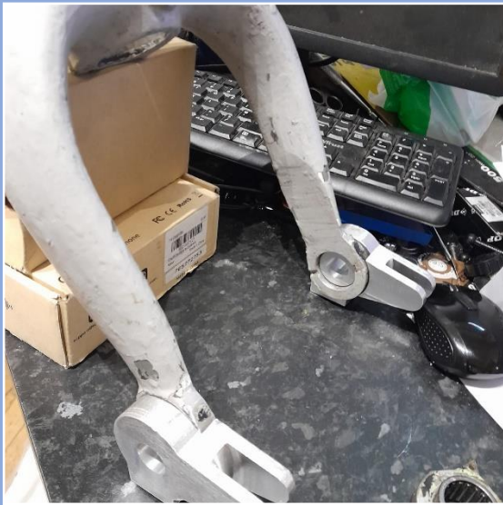
DH Beaver tail wheel yoke with towing lugs attached.