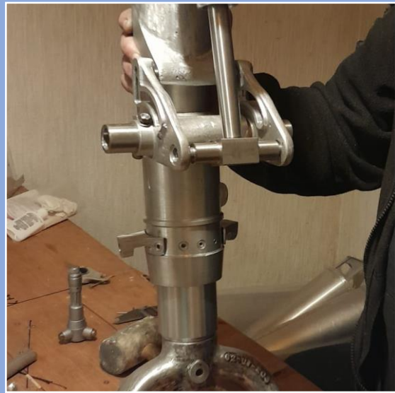
Tail wheel strut mechanism.