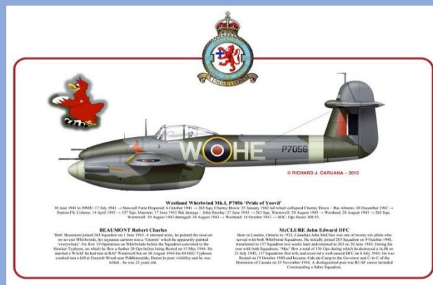
P7056

Just a reminder for all those who are going to visit the Kent Battle of Britain Museum at Hawkinge don't forget that your current membership card allows you 50% discount on entry to the Museum.