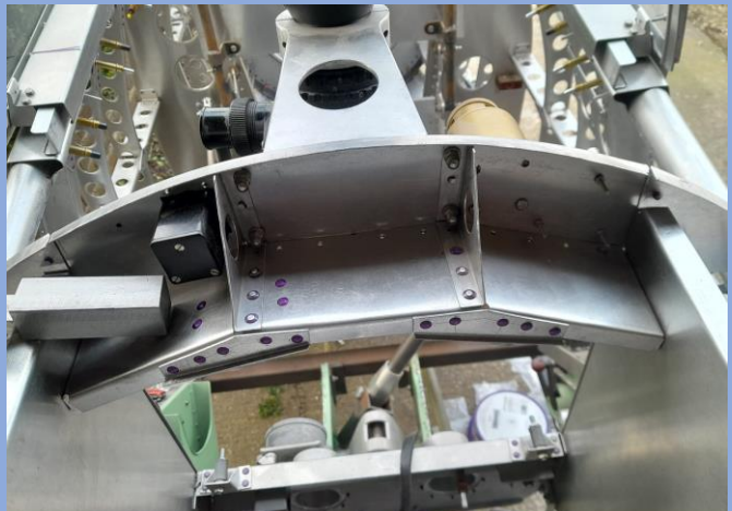
Cockpit stripped out, windscreen and top coamings off, half way through the big rivet.