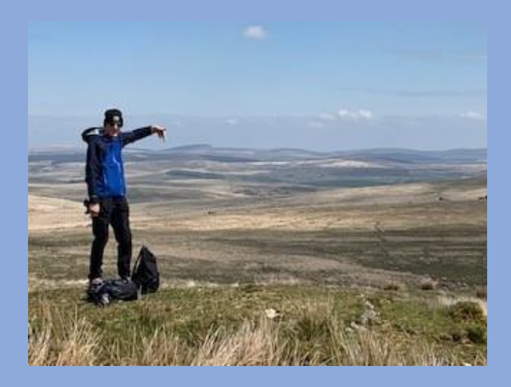
No! it's over here...