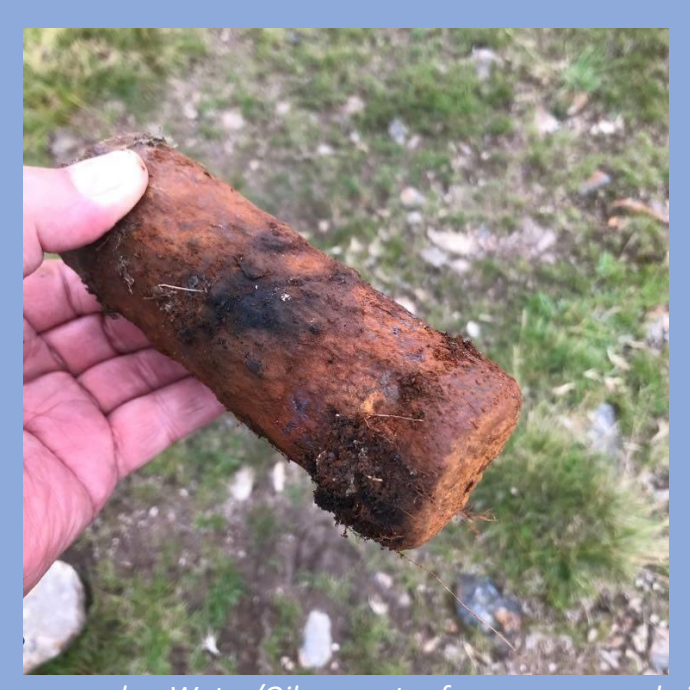
Pressure vessel or Water/Oil separator for a compressed air system?