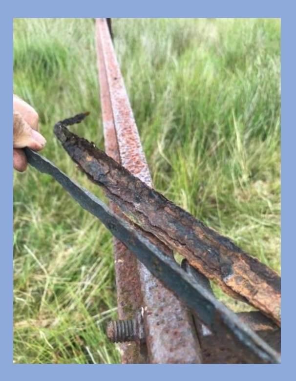
ongeron or stringer?