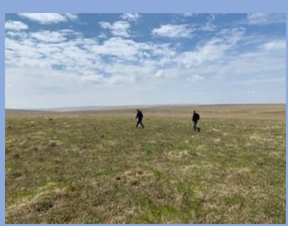
Here we go again