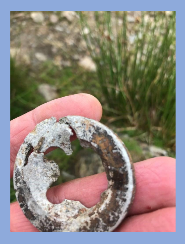
Alloy disc (black)