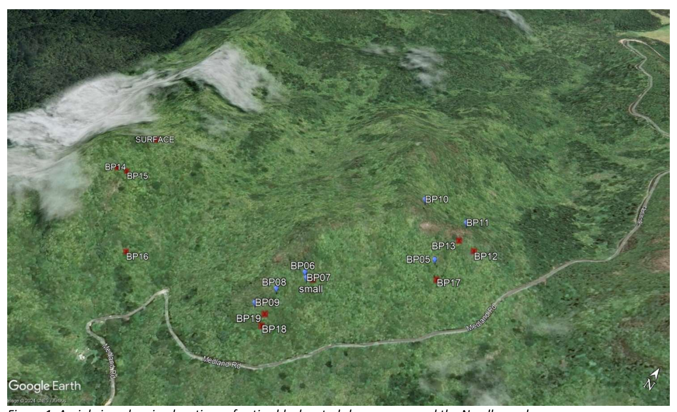
Figure 1. Aerial view showing locations of active black petrels burrows around the Needles rocks