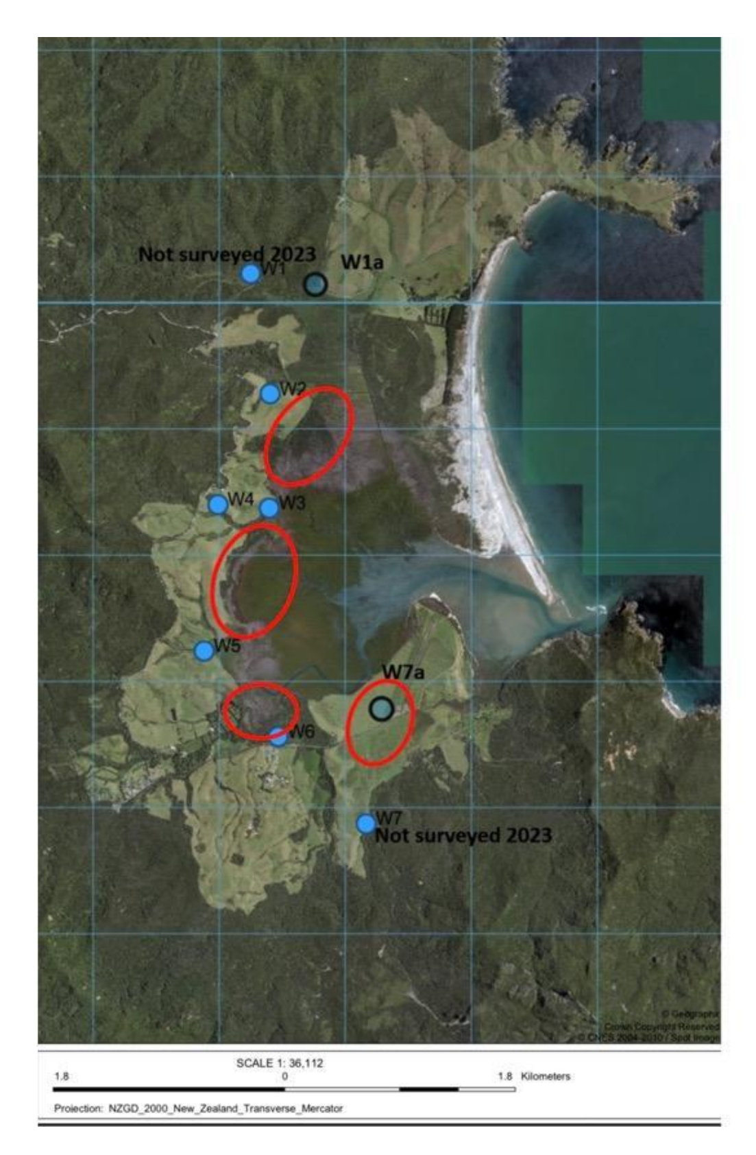
Fig 2. Whangapoua area showing stations and approximate locations of boomers (red ovals).