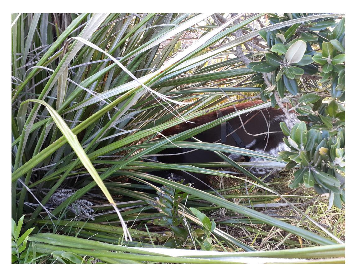
Miro indicating that there is an active grey-faced petrel burrow here under the astelia