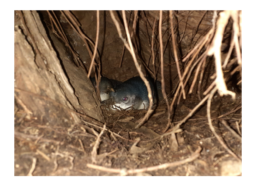
A pair of korora inside the trunk of a pohutakawa, Millers Point