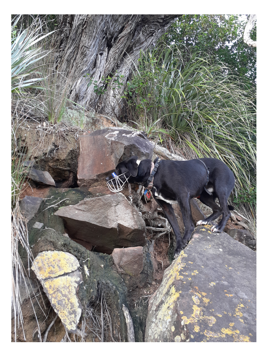
Rua indicating on an active penguin burrow at Millers Point