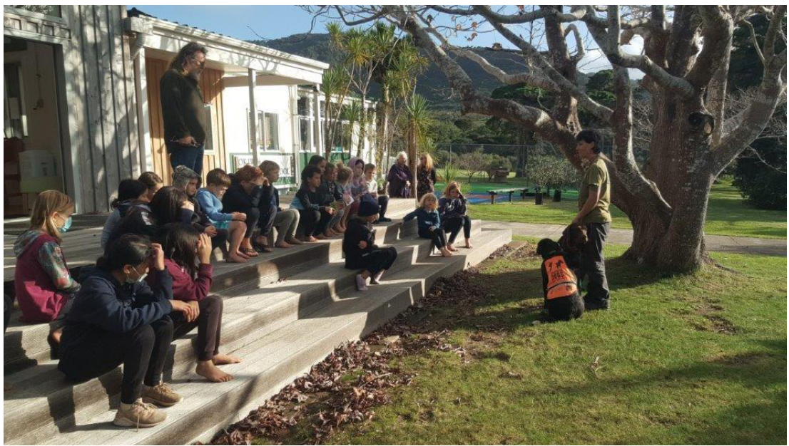
Okiwi School talk