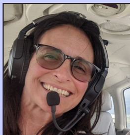
LISA - MEMBERSHIP -