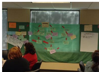
Participants engaged in developing their own organizational theory of change.

Join with fellow nonprofit leaders in a fun three month learning community where you and up to 2 members of your staff will learn about, collaborate, share and create your organization's theory of change.