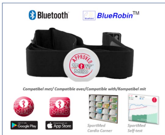
Illustratie – SportMed LST-2 borstband (CSP8 type)