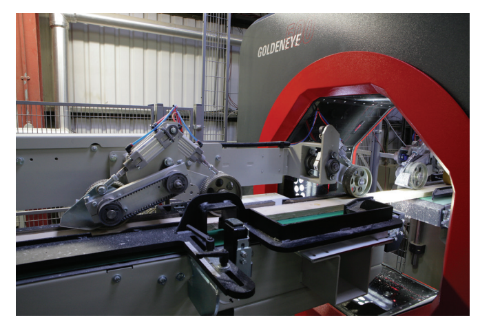
Goldeneye, roofing batten scanning line.

Marley has a wealth of expertise and outstanding knowledge of the roofing and timber markets. At our specialist timber manufacturing site in Gainsborough, timber battens for roofing are manufactured using a state-of-the-art, dedicated roofing batten scanning line, Goldeneye, which scans each timber batten intricately by the millimetre to ensure compliance with BS 5534.