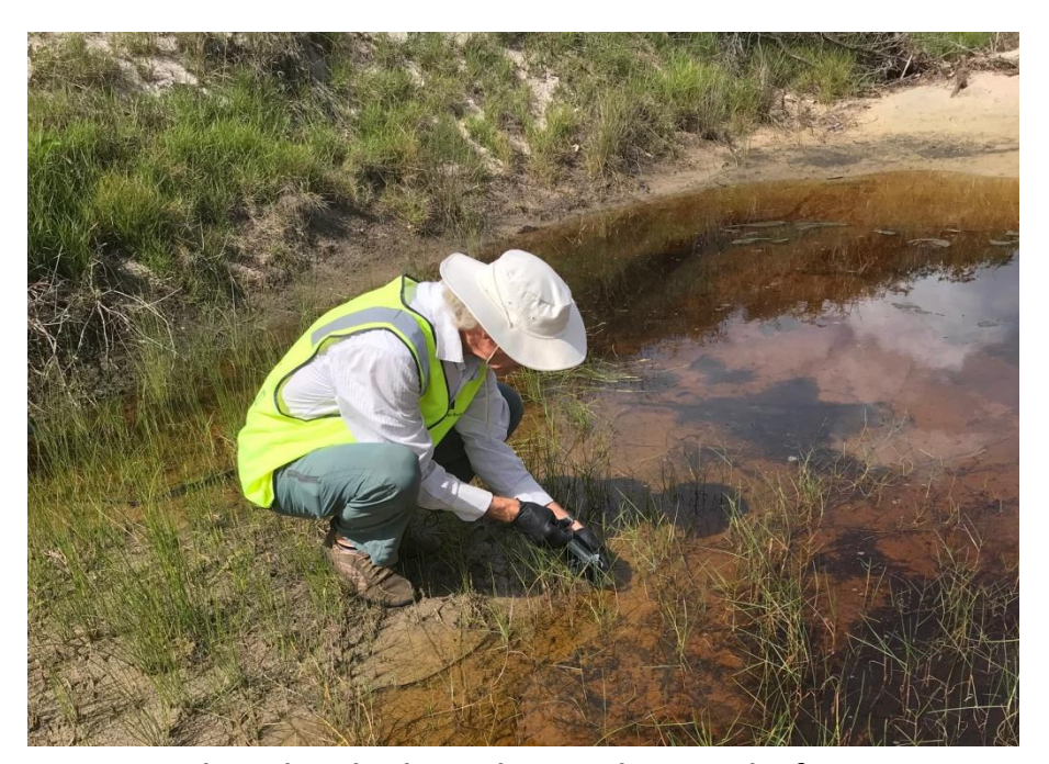
Water Sampling - beachside creek at Bunkers south of Cowan Cowan

Extensive water sampling occurred this day at creeks on the Western Beach. Again a patch of Singapore Daisy was noted at the creek behind the beach north of the Bulwer Helipad. Most was removed on a return visit after this Campaign. Further work needs to be done here with a brushcutter to cut long grass on the creek bank to enable removal of all Singapore Daisy.