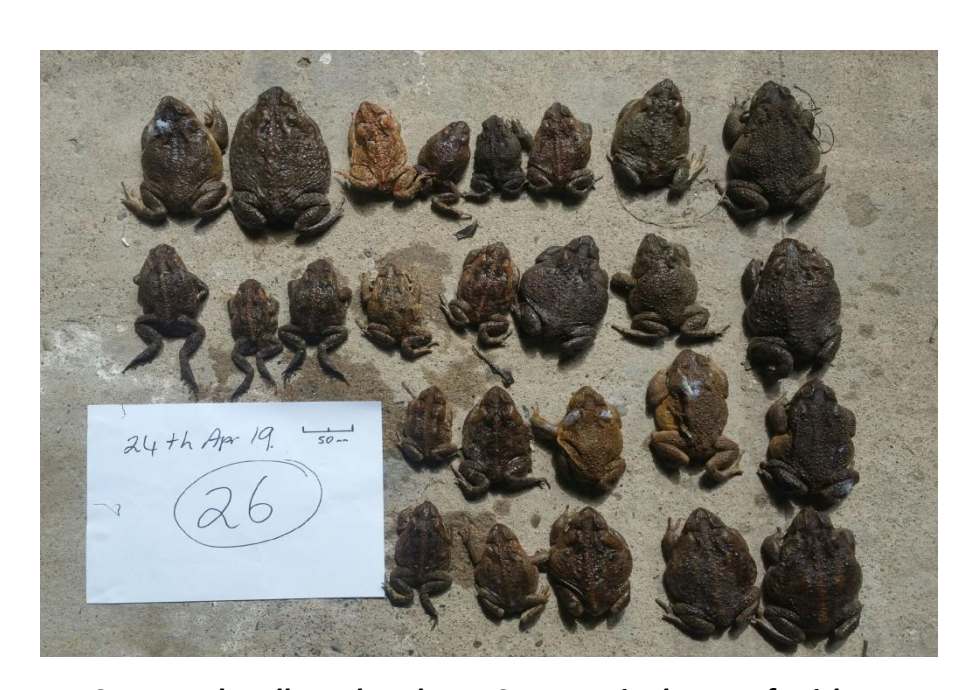
Cane toads collected at the MICAT Terminal, Port of Brisbane