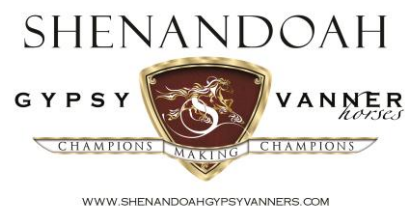
Covered Arena VIP Sponsor