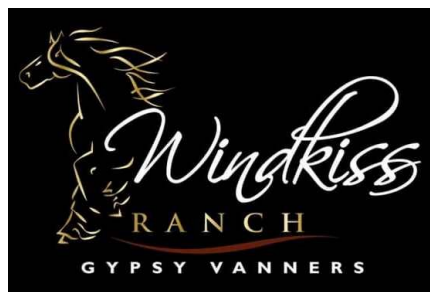
Media & Videographer Sponsor