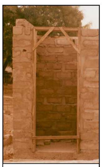
The toilets under construction

already been sent to Kaleo and at present we are getting together a further shipment consisting of books, toys and musical instruments suitable for the children's age group and of course all having educational value.