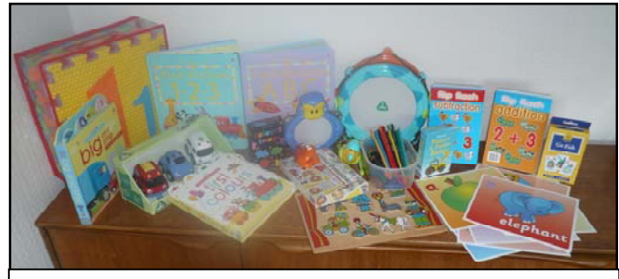
Some of the toys, books and resources that will be sent to Kaleo

Thanks to you all, this work can and will continue.