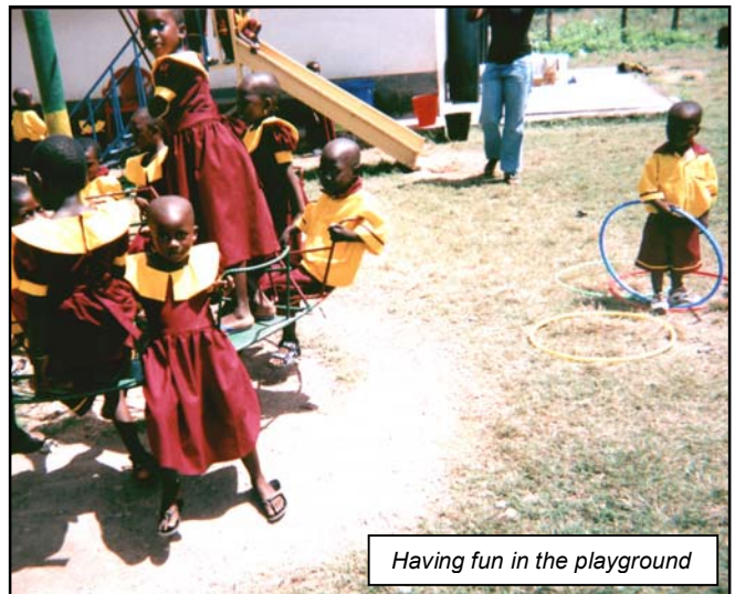
Having fun in the playground