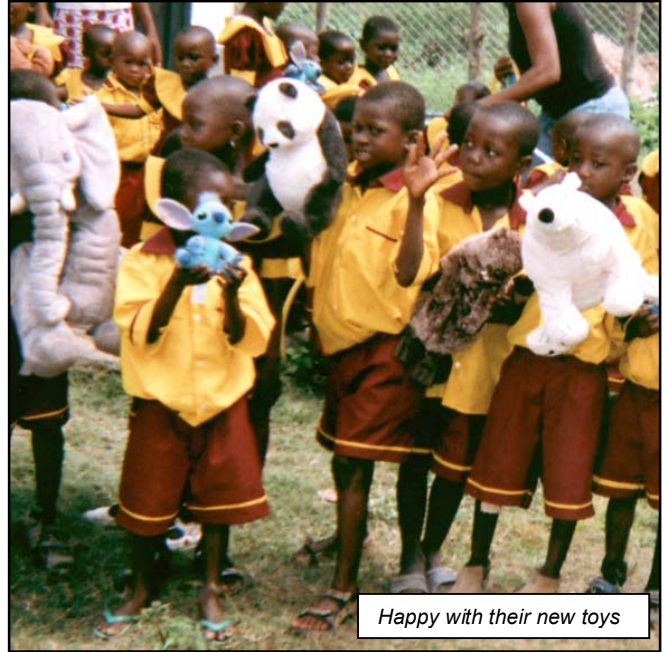
Happy with their new toys