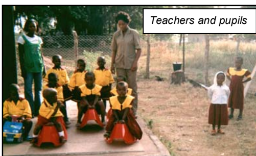
Teachers and pupils