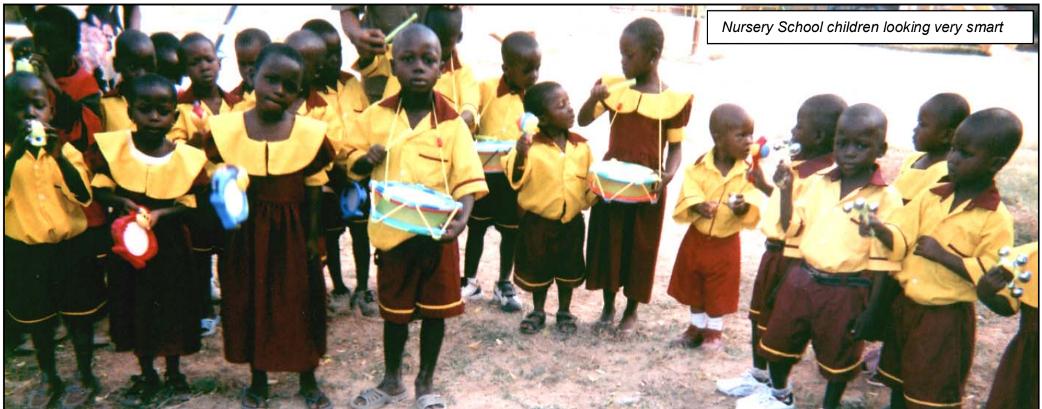
Nursery School children looking very smart

The local economy has also received a boost from the manufacturing of the play equipment and furniture for the nursery as well as the school uniforms. All these things were made locally by skilled craftsmen and tailors.