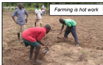
Farming is hot work

To help with the cost of the daily meal given to each child the pupils' parents and Church members have prepared land to make a farm. Planting started recently when parents and Church members gave up a whole day to work on the farm. We believe it is important for the local community and especially the pupils' parents to be involved in the Nursery School and to get a sense of ownership and responsibility. By working together on the Nursery School farm they are making an important contribution to the success of the project. We hope and pray they will get a good harvest!