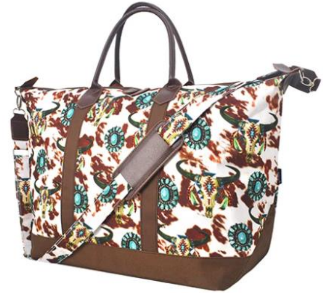
Bulls and Cows