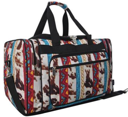
Aztec Cow Print