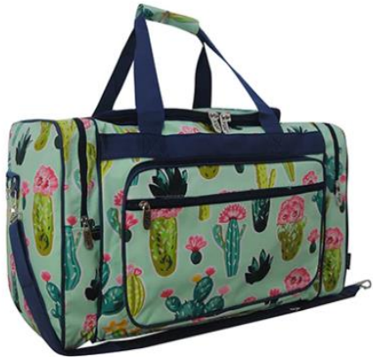
Stuck on You