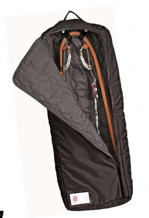
Dura-Tech Padded Bag Measures: 15" W x 34" L x 5" Deep