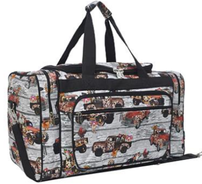
Country Vintage Truck