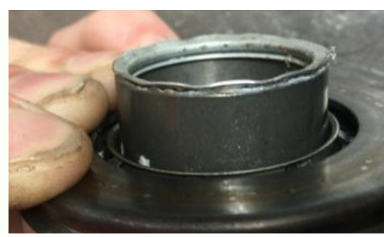
Damaged Piston Stop