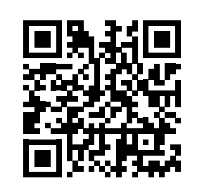
Scan with a QR app on your smart phone