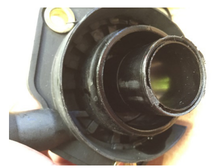
Off Axis Wear On Guide Tube