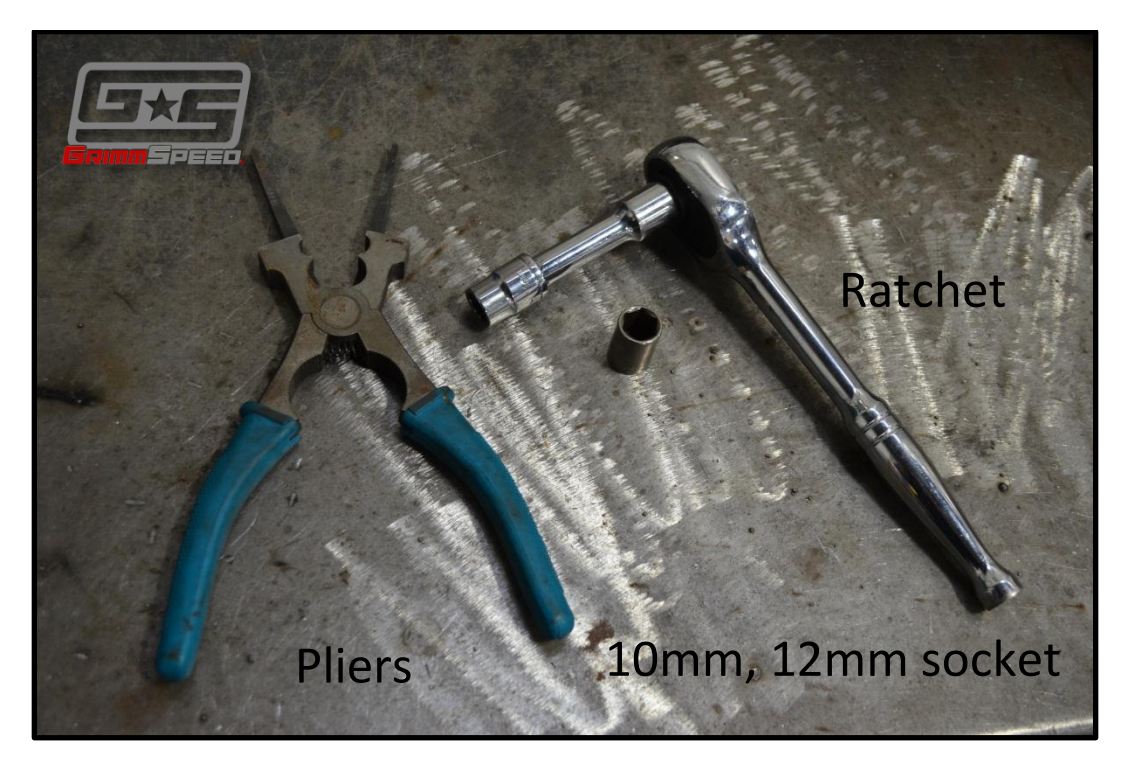
Figure 1: Tools

<u>Tips:</u> Using an extension will help give you more space to spin the ratchet and avoid damaging your radiator shroud.