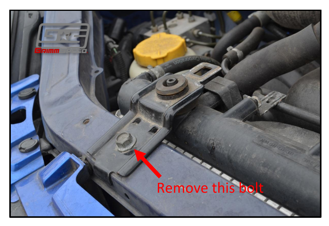
Figure 4: Remove OEM radiator stay brackets

4. Next, pop the black rubber bushings out of each of the brackets that you just removed. Also remove the hood prop holder (02-07 only). You will reuse each of these three (3) parts in the installation of your new radiator shroud.