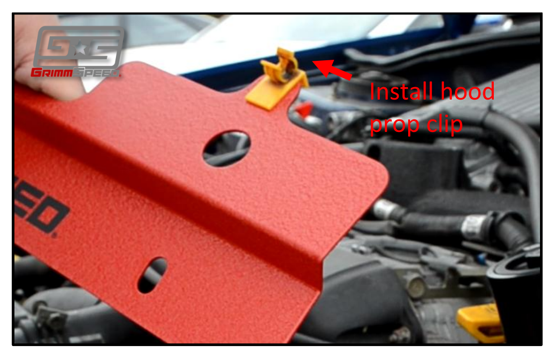
Figure 7: Install hood prop clip

5. Now grab your shroud and locate the rectangular hole for the hood prop bracket. Your stock bracket should pop right into it (02-07 only). Do the same with the two (2) stock rubber bushings. Note that the larger portion of the bushing goes on the bottom, contacting the radiator.