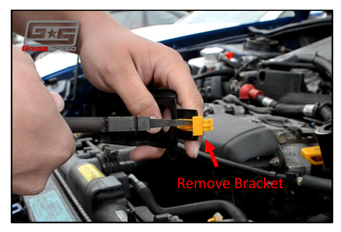
Figure 6: Remove hood prop bracket

5. Now grab your shroud and locate the rectangular hole for the hood prop bracket. Your stock bracket should pop right into it (02-07 only). Do the same with the two (2) stock rubber bushings. Note that the larger portion of the bushing goes on the bottom, contacting the radiator.