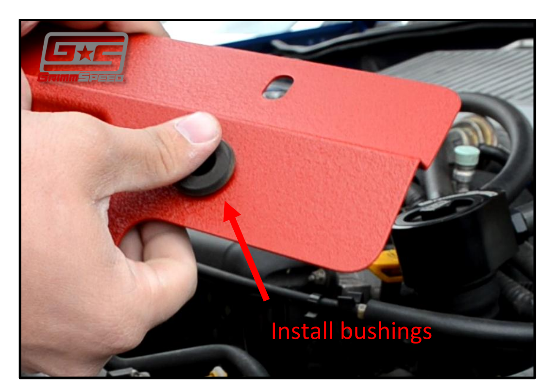
Figure 8: Install rubber bushings