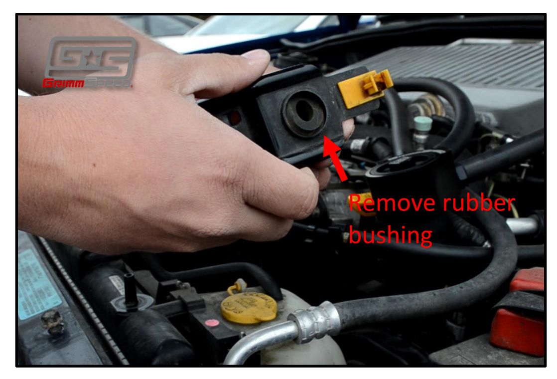
Figure 5: Removing rubber bushings

4. Next, pop the black rubber bushings out of each of the brackets that you just removed. Also remove the hood prop holder (02-07 only). You will reuse each of these three (3) parts in the installation of your new radiator shroud.