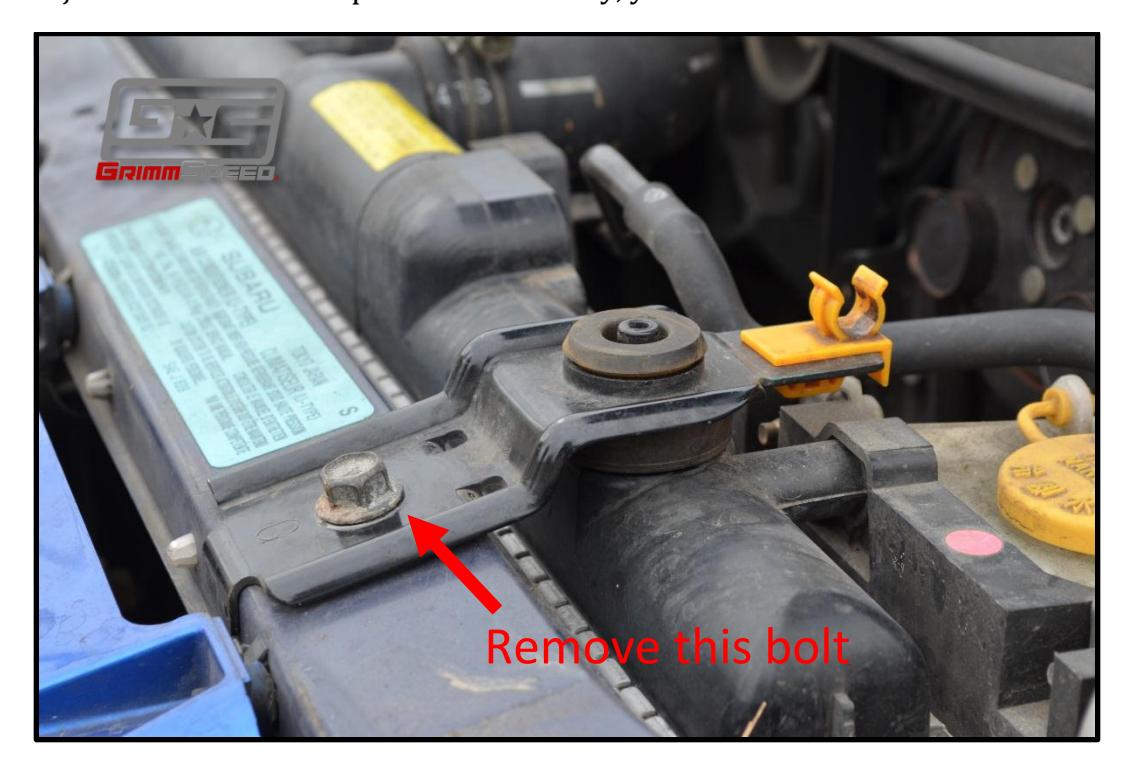
Figure 3: Remove OEM radiator stay brackets

3. Using your 12mm socket and extension, remove the two (2) 12mm bolts securing your 0EM radiator stay brackets. Your radiator should stay in place just fine for now. Keep these bolts handy, you will reuse them.