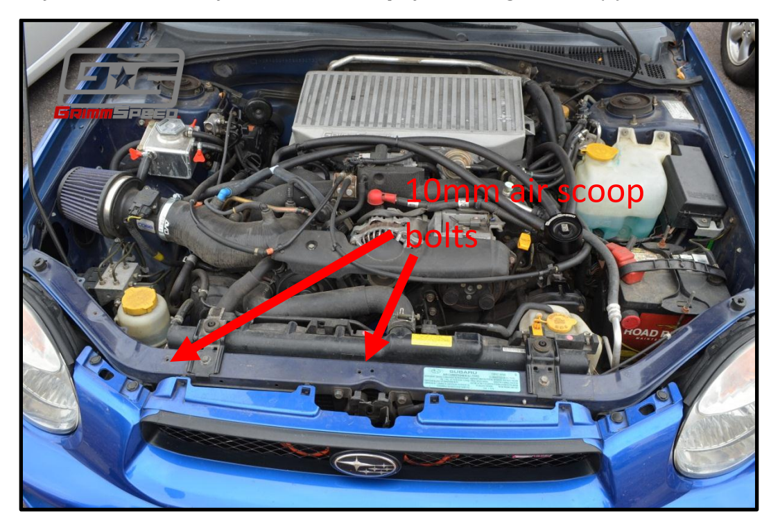
Figure 2: Air scoop bolt locations