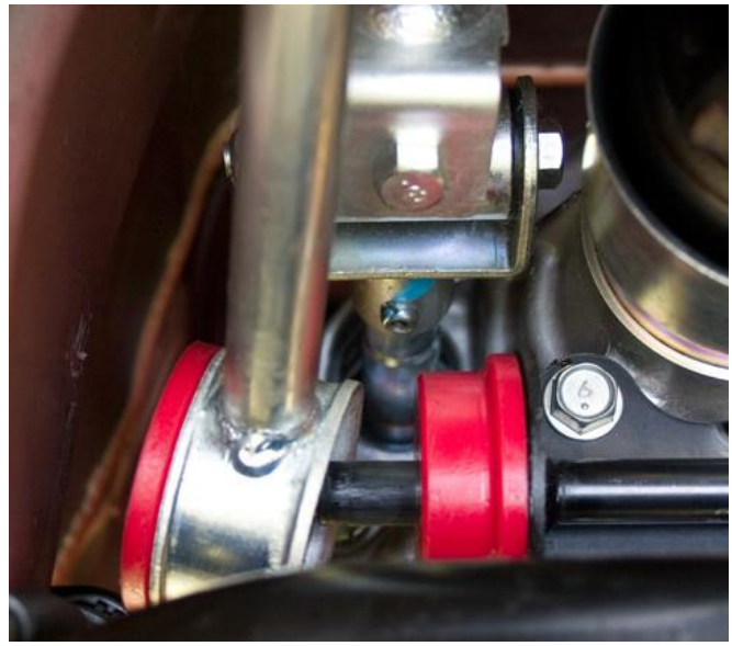
5spd shift rod being removed at tranny.