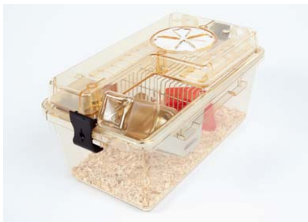
Complete IVC 2 L type cage incl. cage, stainless steel lid, filter level, filter top incl. CO 2 membrane and water bottle

ZOONLAB IVC cages offer a range of versions as well as a wide variety of options to optimally suit your needs. The entire cages made of polycarbonate are autoclavable up to max. 121°C and those manufactured using polysulfone are autoclavable up to max. 134°C.