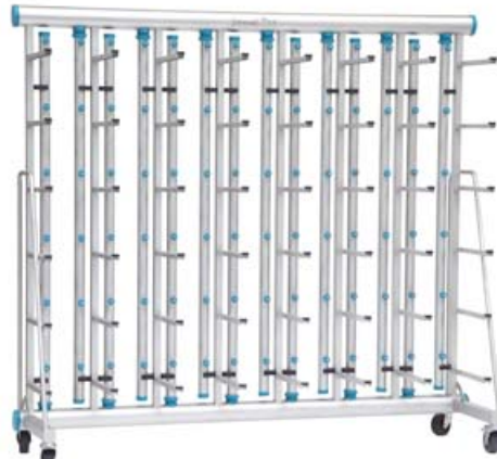
Vent LT BIO. A.S.® IVC cage rack

Vent LT BIO. A.S.® racks for IVC cages are made of stainless steel (AISI 304) and characterized by high quality and ergonomic handling. The IVC cages offer high adaptability and a wide variety of options to optimally suit your needs.