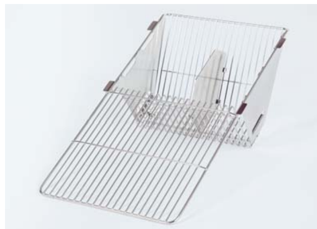
Stainless steel lid with hinged divider for 2 L type cage