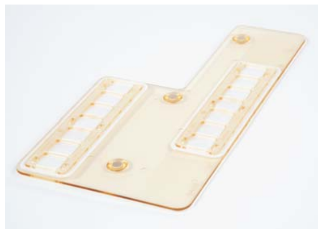
Filter level consisting of ventilation cover, holding frame and filter pad for 2 L type filter top