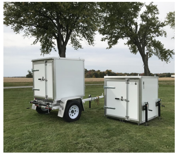
Available as a TRAILER or SKID