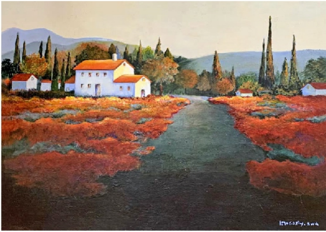
Leona Moriarty "Lowered Lights"