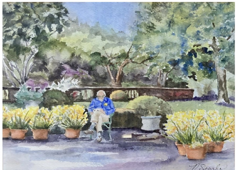
Norma Searle "Visiting Filoli"