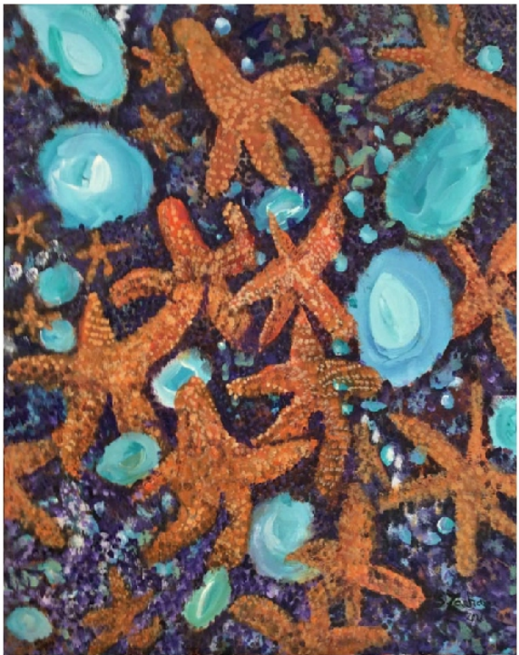
Sherry Zacharia "Colors of the Sea Floor"