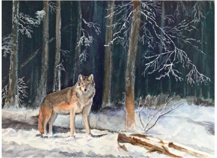
Lynne Flodin "Out of the Dark"