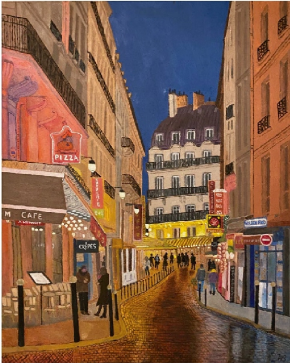
Bill Bakun "Latin Quarter"