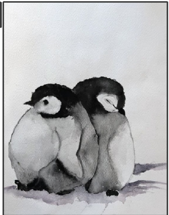
Kerstin Rounds "Keeping Warm"