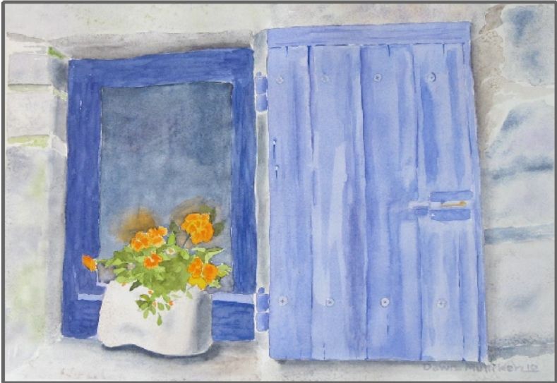
Dawn Mulliken "Complements"