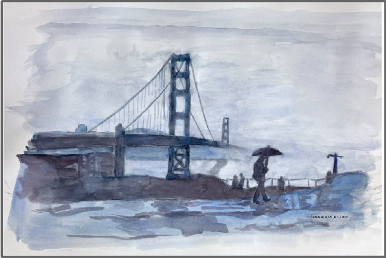
Lou Maraviglia "Rainy Day in S.F."