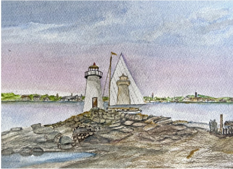
Kerstin Rounds "Harbor Lighthouse"