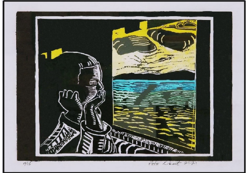
Pete Dent "Day Dreaming"