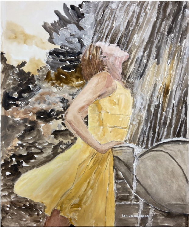
Lou Maraviglia "Fountain of Youth"