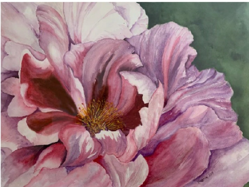
Kerstin Rounds "Petals"