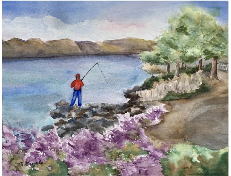
Norma Searle "Fishing in the Bay"