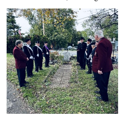
Re-dedication of the Council's Monument to the unborn.