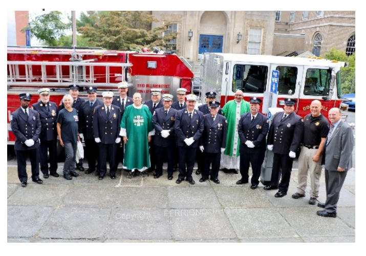
Our Blue Mass participants outside Saint Patrick's, at 55 Grand Street, Newburgh.