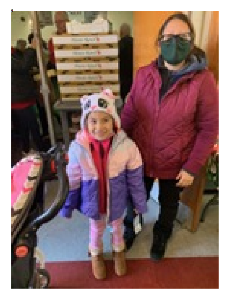
The joy of a new winter coat

Contact Greg Gaetano PGK 845-629-2722 (Please keep in mind that the clergy are our guests and as such we all chip-in to pay their tab as well as our own.)